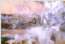
OLIVE PSYLLID, EUPHYLLURA SPP.